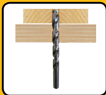
STEP 1: Drill ½" hole